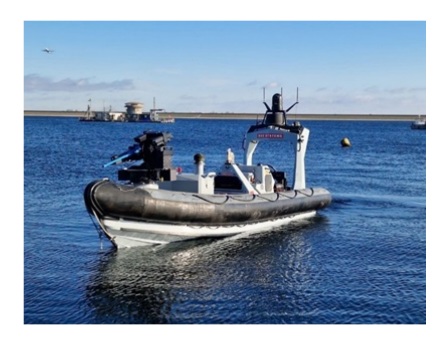
Diagram 1 - NavyX APAC

3. Designated trials period will be from 0900 – 1600 daily and include the APAC operating in Remote/Autonomous Mode, constrained to the confines of 2 Basin. Trials Staff, in agreement with Harbour Control, are to verify when the Trial Runs are to start and end in a safe manner.